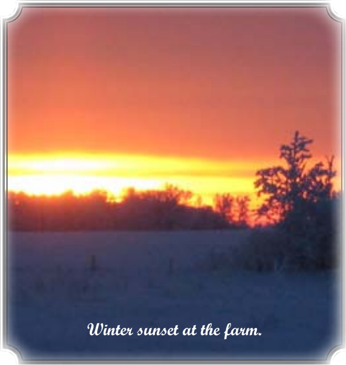
Winter sunset at the farm.